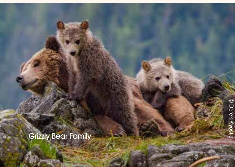
Grizzly Bear Family

In order to help more people learn about nature-based climate solutions, Nature Canada has enlisted