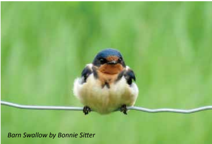
Barn Swallow

Nature Canada supporters played a key role last year in ensuring a brighter future for species at risk by signing our swallows petition and supporting our advocacy of species at risk protection. Dozens of species at risk, including Barn Swallows and Grizzly Bears, now have a brighter future given the new federal commitment to declare legal listings for species threatened or endangered based on the recommendations of the scientific advisory committee.