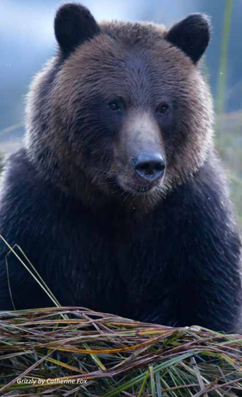
Grizzly by Catherine Fox