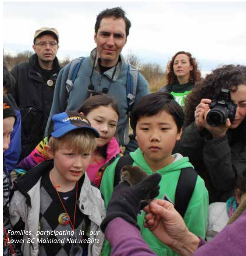
Families participating in our Lower BC Mainland NatureBlitz