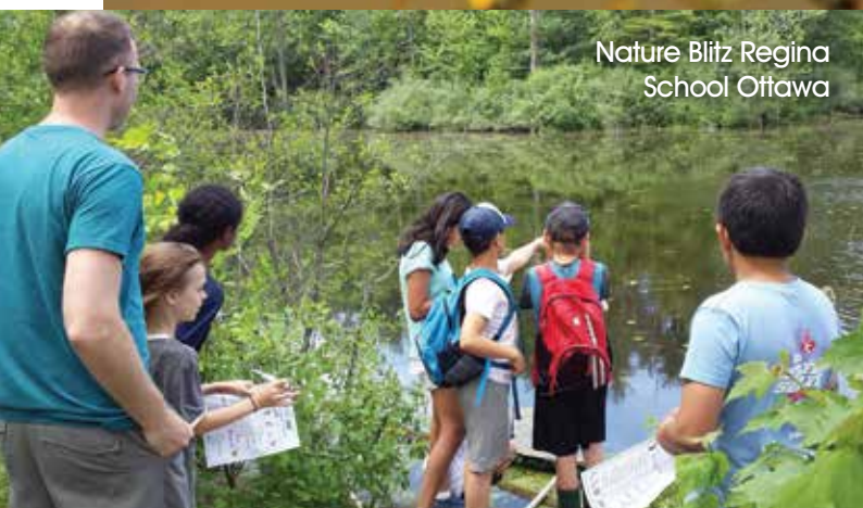
Nature Blitz Regina School Ottawa